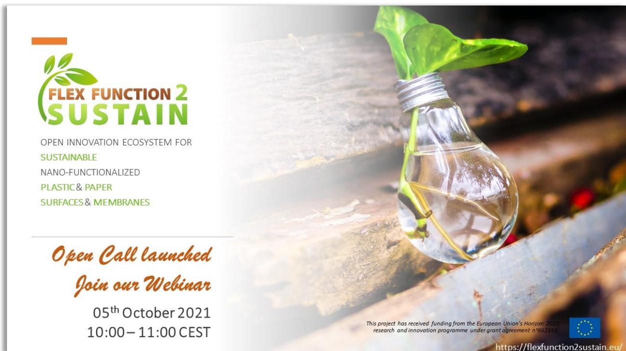
Figure 2: Promotional material used for promoting the Open Call