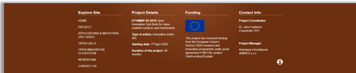
Figure 2: FlexFunction2Sustain Project Details section

The FlexFunction2Sustain homepage provides some basic information on the project in the bottom frame “Project Details” (i.e. including call identifier, type of action, starting date, duration of the project, as well as Grant Agreement number), along with Contact information. There is also the acknowledgment of the EU funding “This project has received funding from the European Union’s Horizon 2020 research and innovation programme under grant agreement No 862156” including an image of the EU flag. The bottom page’s visualisation remains constant on all pages.