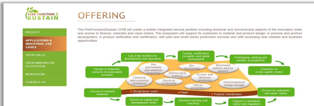
Figure 5: "Offering" subsection

Based on the experience of the partners and the validation of the Use cases companies, the offering of the FlexFunction2Sustain OITB is outlined here. This section will also include information of the core competencies both of the Single Entry Point company and all members of the OITB. Forthcoming updates will be taking place in this section.