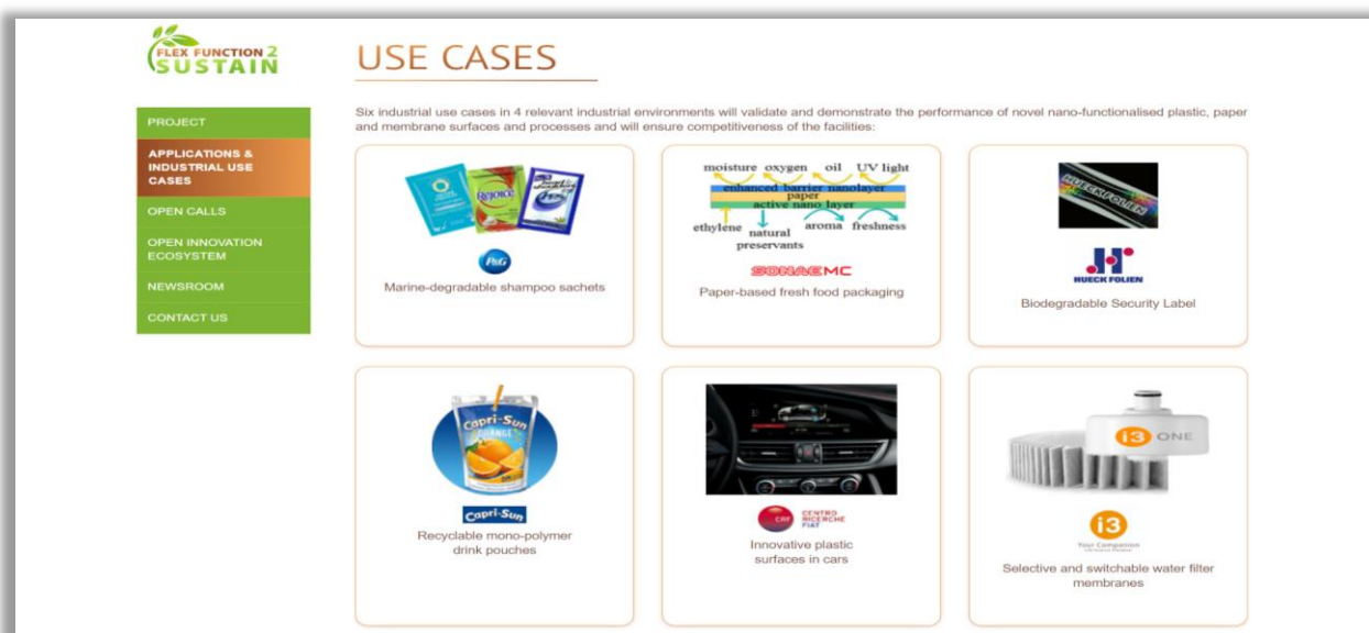
Figure 7: “Use cases” subsection

This section contains basic information about the industrial use cases that will validate and demonstrate the performance of the novel nano-functionalised plastic, paper and membrane surfaces and processes and will ensure competitiveness of the facilities. These serve mainly as a teaser of the OITB’s capabilities and a reference for its potential future clients. Therefore, the information for the Use Cases is presented in a more attractive visual way with logos of the companies involved and a picture of the outcome that they are pursuing.