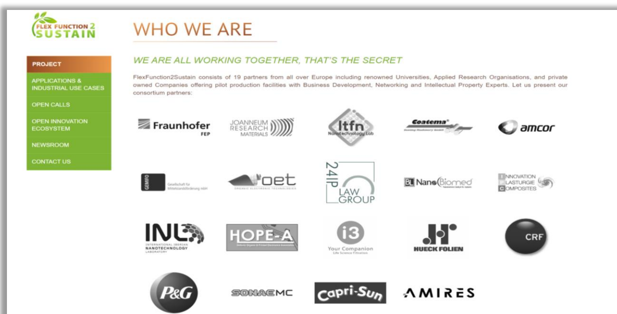
Figure 3: “Who we are” subsection

The FlexFunction2Sustain consortium consists of 19 partners with complementary backgrounds that will help to achieve challenging goals of the project. The aim of this page is to provide high visibility to the project partners. Therefore, each partner is presented by its logo and a link to its homepage.