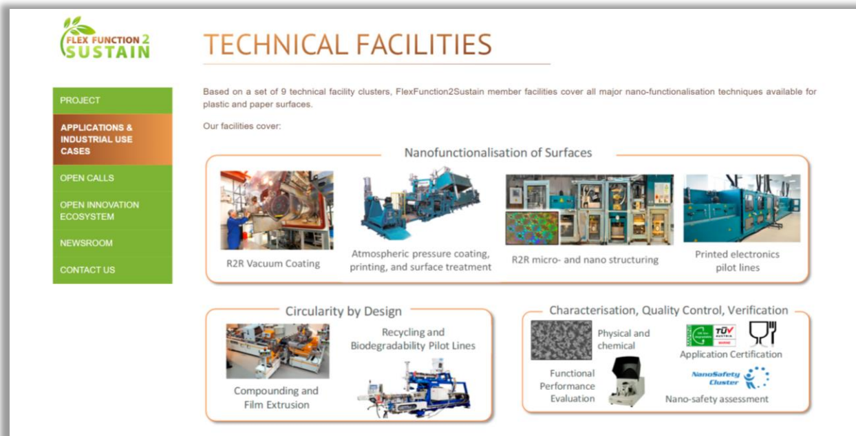
Figure 6: “Technical facilities” subsection

This section provides an overview on the technical facility clusters covered by FlexFunction2Sustain members. Potential customers visiting the website can see what facilities for nano-surface modification of plastic and paper surfaces will be used by the consortium partners. This part of the website will be continuously updated with information material (flyers, etc.) about the facilities and their technical specifications performances (such as web with etc.)