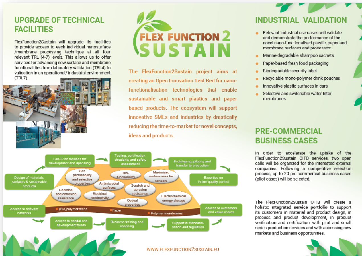
Figure 5: FlexFunction2Sustain brochure (back page)

Further, a Handbook of nano-functionalized flexible surfaces with prototype specifications and indicating main values comparing with other technologies will be prepared (deliverable D8.10, due M12). This project handbook will serve as an advanced promotional material describing the main capabilities and offers of the OITB.