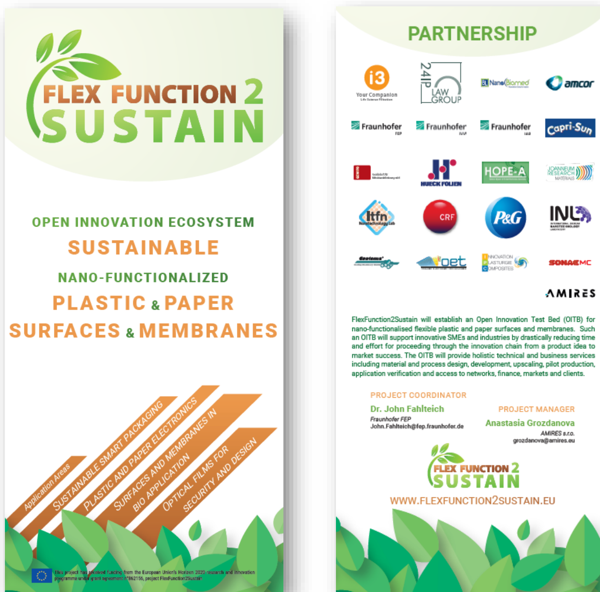
Figure 3: FlexFunction2Sustain leaflet

The leaflet of FlexFunction2Sustain is represented in Figure 3.