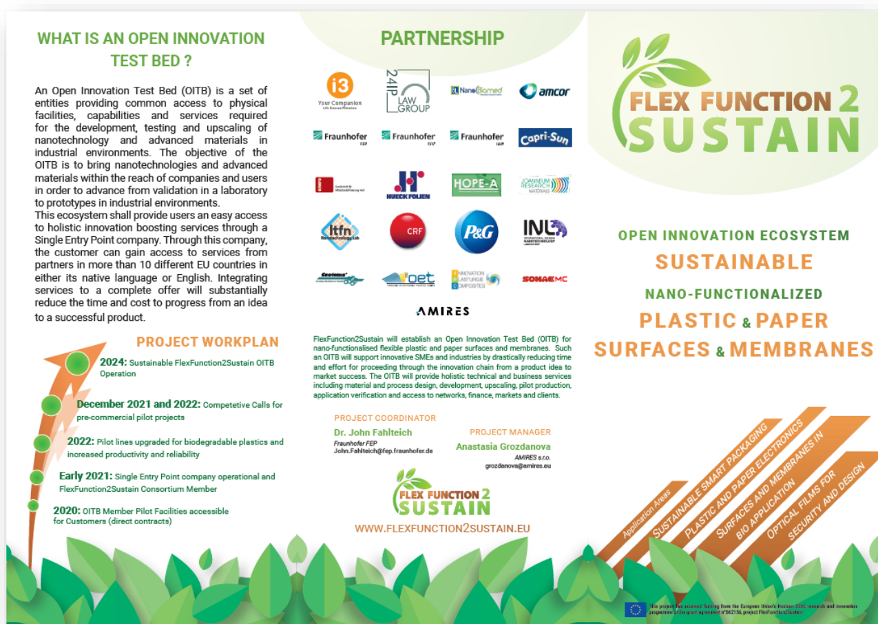
Figure 4: FlexFunction2Sustain brochure (cover page)

Also, the list of the consortium partner is included on the back side of the brochure.