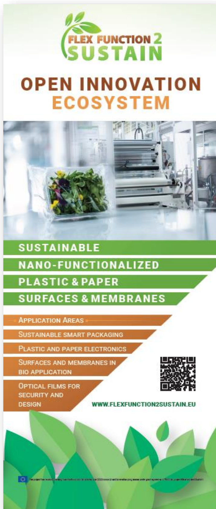
Figure 6: FlexFunction2Sustain roll-up