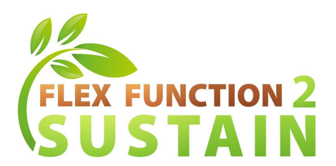
Figure 1: FlexFunction2sustain logo

Several proposals for the project logo were designed and discussed with the coordinator, based on which the following logo (Figure 5) was chosen as the best graphical representation of the project idea. The project logo is used in all the project related advertising materials including templates, website, leaflets, brochures etc.