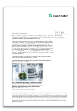
Figure 8: FlexFunction2sustain Press Release on project's launch

Additional press releases will be produced during the course of the project and they might be connected with important results / milestones achieved. The next press release (planned for end of 2020 / early 2021) will announce the successful establishment of the Single Entry Point company. All the press releases published by the project will be available on the FlexFunction2Sustain project website.