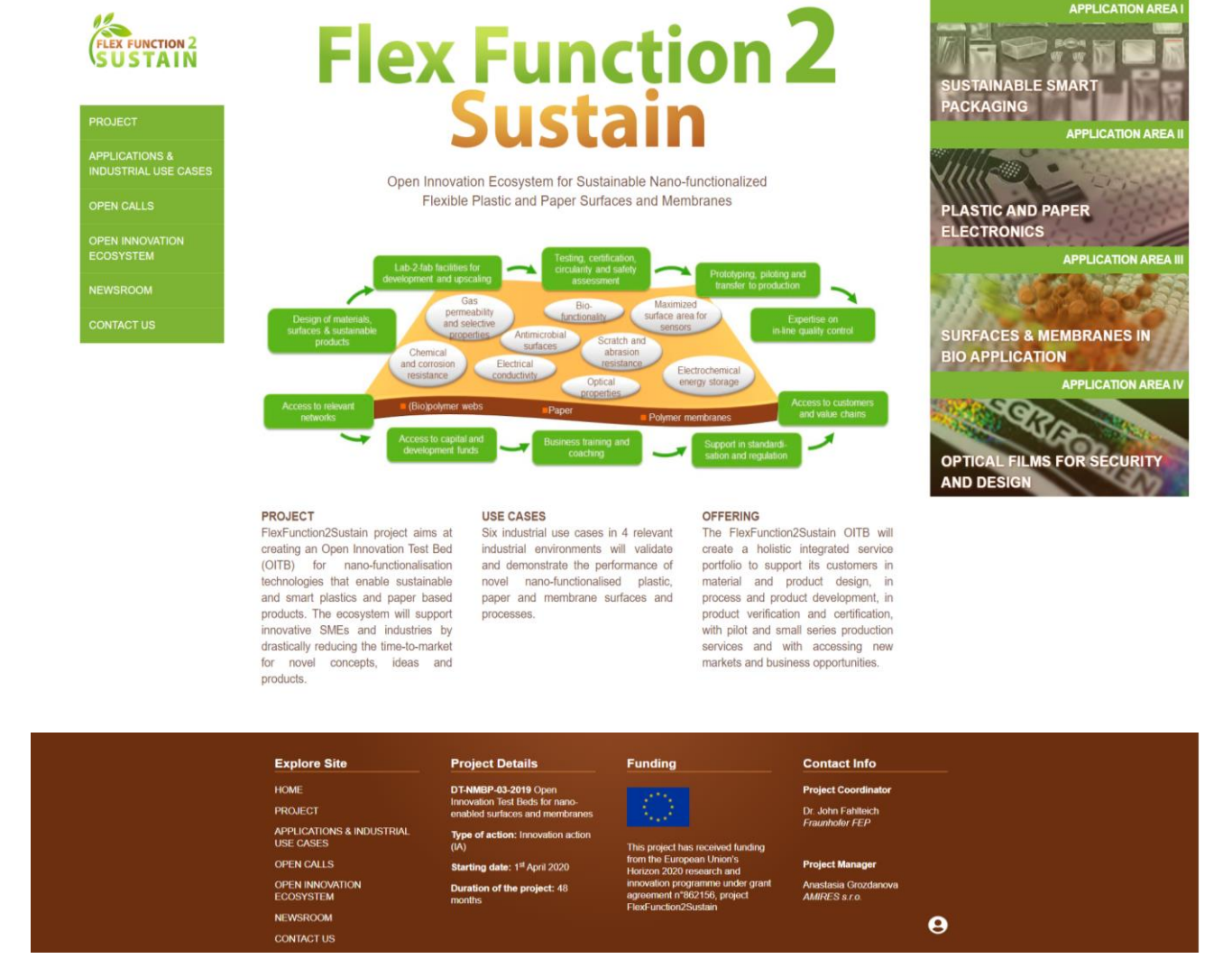
Figure 6: FlexFunction2sustain website introductory page

The website structure is composed of 6 main pages. The main navigation menu is placed at the right side of the webpage and includes the following sections (with their respective subsections, visible as soon as moving the mouse on the page title): Project (subpages: Who we are, Our Ambition), Applications and Industrial Use Cases (subpages: Offering, Technical Facilities, Use Cases), Open Calls, Open Innovation Ecosystem, Newsroom and Contact us. The website provides acknowledgement of EU funding as follows: "This project has received funding from the European Union's Horizon 2020 research and innovation programme under grant agreement No 862156, project FlexFunction2Sustain."